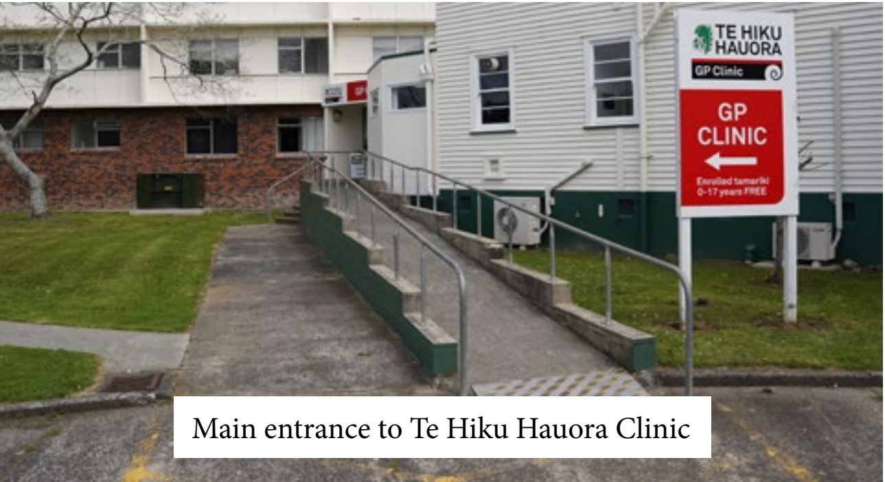
Main entrance to Te Hiku Hauora Clinic